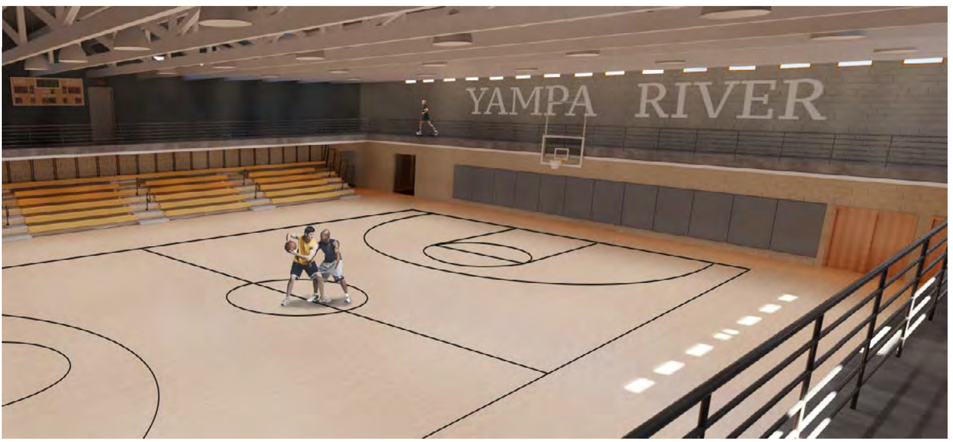
gymnasium with elevated track