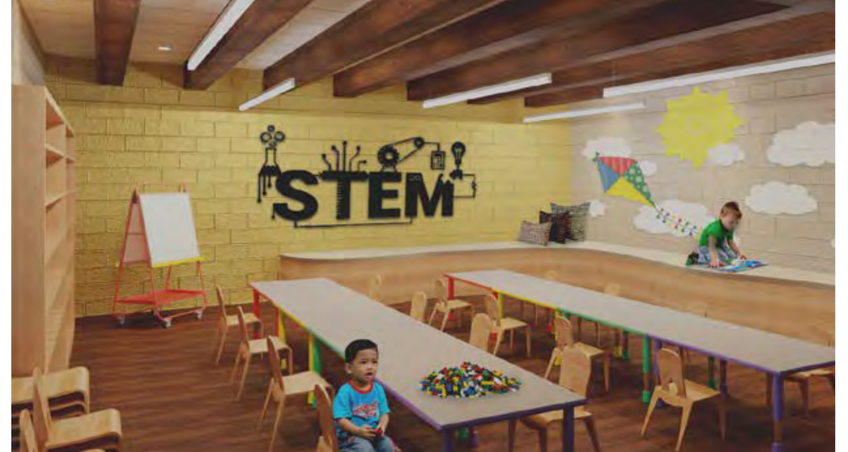
childcare maker space