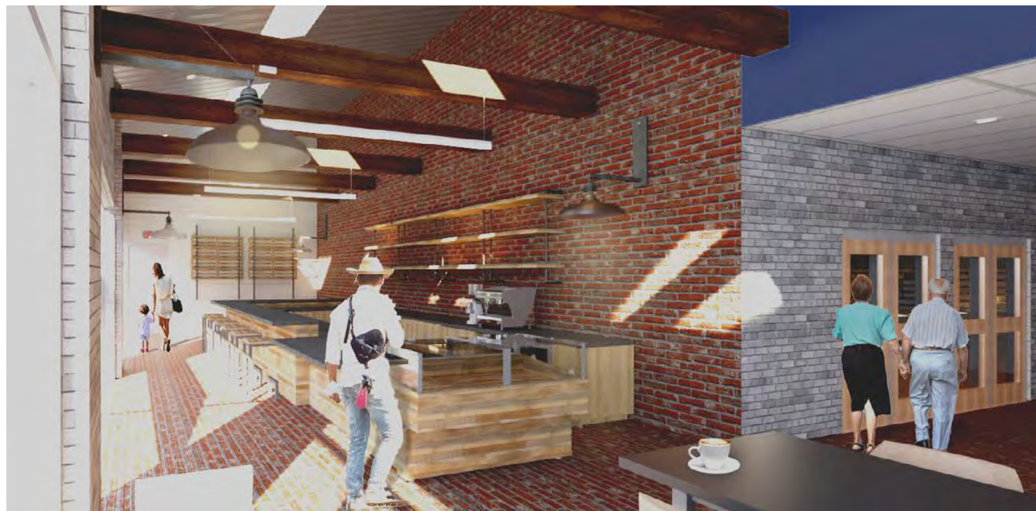
grand entrance and cafe