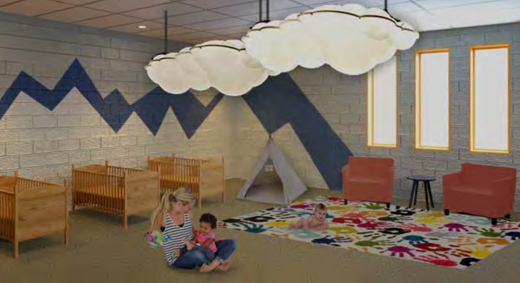
infant care room