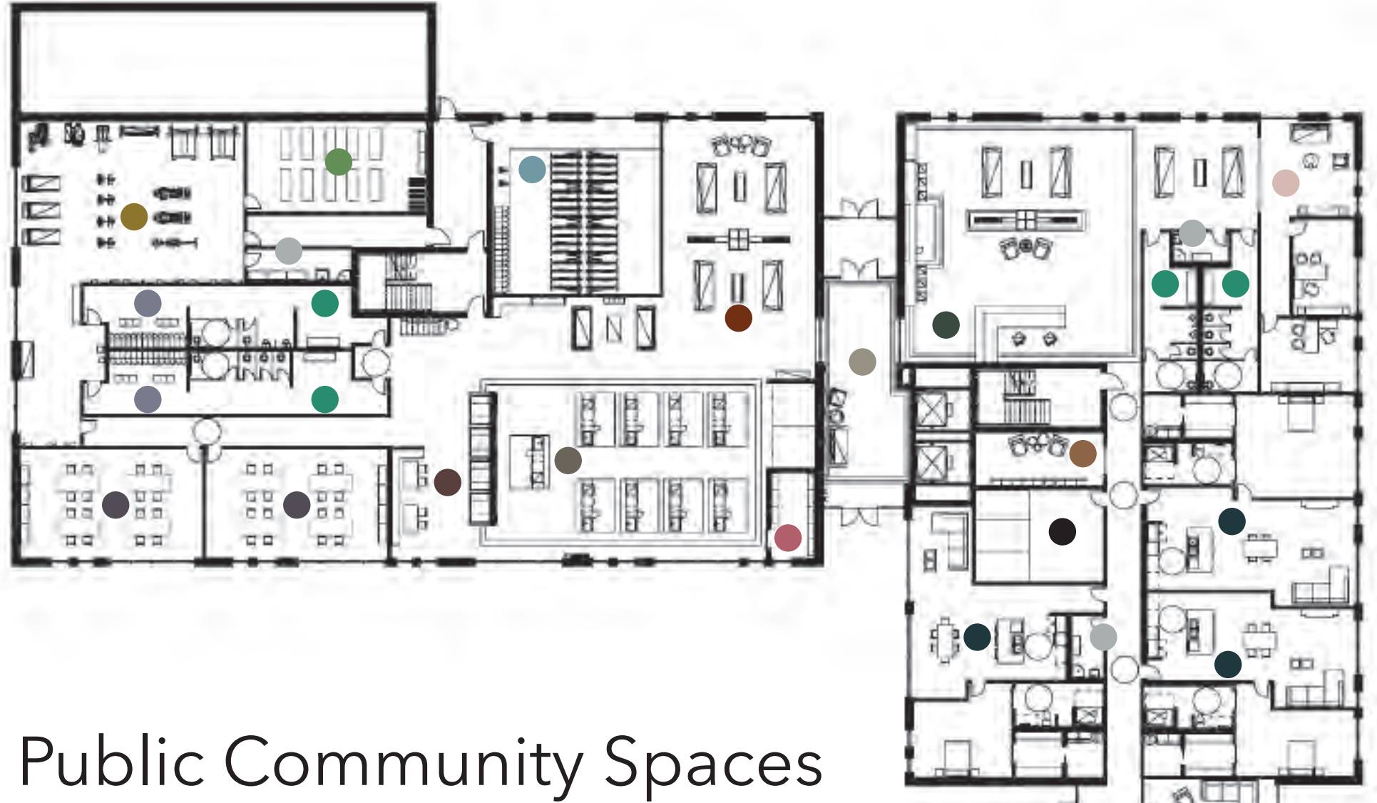
Public Community Spaces