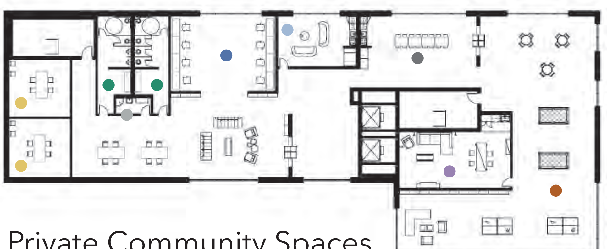
Private Community Spaces