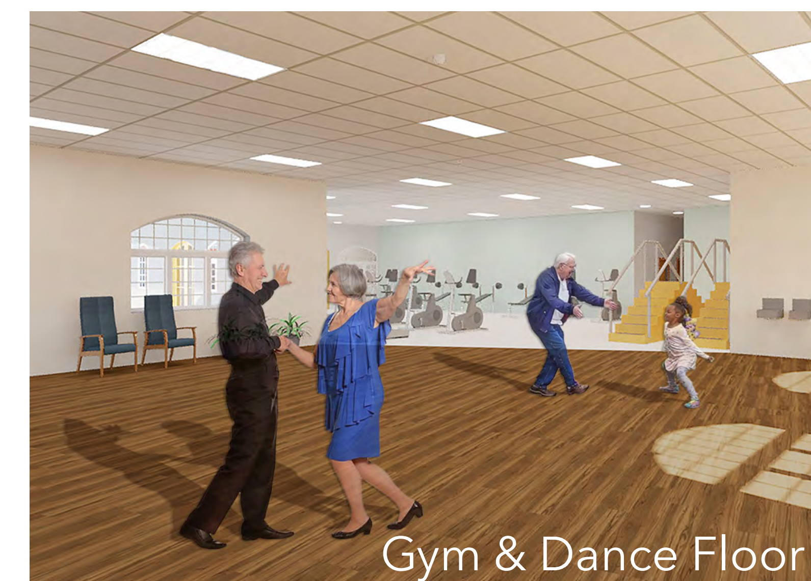
Gym & Dance Floor

The multipurpose room was designed to use music and sound to reconnect patients with memories, emotions, people and places. Virtual reality is used to improve cognition and restore aspects of memory.